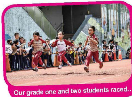
Our grade one and two students raced...