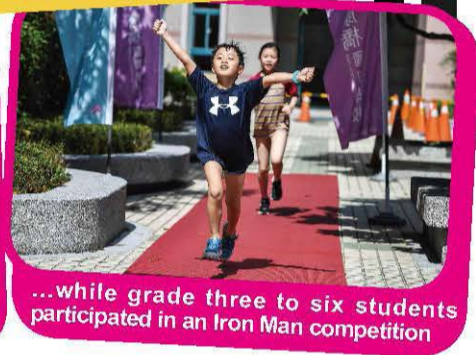
...while grade three to six students participated in an Iron Man competition