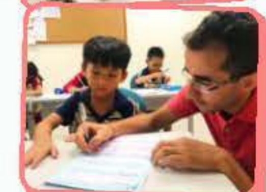
The teacher instructed how to copy the homework into the communication book.