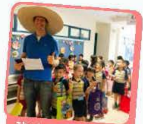
The teacher picked up the students from their lockers.

chance to do arts and crafts to introduce their personalities. In "School Safety", they learned safety rules so that they can stay safe when playing on the playground, doing activities in class, and when taking the school bus. When learning about "Explore the Campus", they walked around the campus with their teachers and drew their favorite places at school. Afterwards, they were more familiar with every corner of the campus and found the coolest hang-out spots where they can share their secrets with good friends during break time. When doing "My Schoolbag", students showed pictures of their schoolbags to everyone in class, and they also learned what they can bring to school. The most interesting topic for students was "The Library." Not only could they listen to stories from their teachers in the library, but also enjoy reading their favorite books in the tree house!