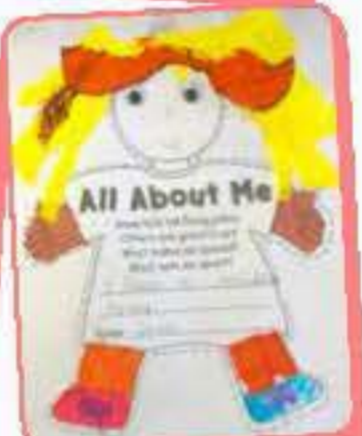
Students introduced themselves.

In the foreign teacher's class, students learned how to be successful grade one students through theme-based learning. Students explored the world of nature and insects, reading a magazine, Buggy Bugs, to gain more background knowledge. Teachers designed activities that taught students class rules, routines, and teacher expectations. For example, a story about ants and grasshoppers taught students they can accomplish anything in class if they give their best effort. Group activities exploring the life-cycle of butterflies conveyed the importance of teamwork and how to work well together. Students designed their own butterfly masks and shared their artwork with each other on stage to develop participation and expression skills. Each activity involved routines that when followed were rewarded with praise to motivate good behavior. There was also a focus on phonics sounds and ABC writing. Both were introduced by singing songs and watching interesting movie clips to create enthusiasm towards written work in grade one.