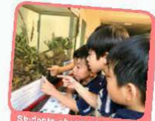
Students observed the larvae in the nature area.

Elementary school is a big turning point in life; being a first grader, the child will need to face and adapt to the pressures of learning. It is very important that parents work together with teachers to prepare their children for elementary life. After this two-week transition camp, we can already see positive changes in all our first graders. From their faces and the interaction between the teachers and the students, we can tell that every child enjoyed the time and built up their confidence. They like to come to school and enjoy learning English with their teachers. We also believe that they will be able to adjust to this new learning environment very well and are ready to be successful first grade learners. This is the first step towards a wonderful elementary school experience.