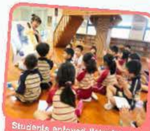
Students enjoyed listening to a story in the library.